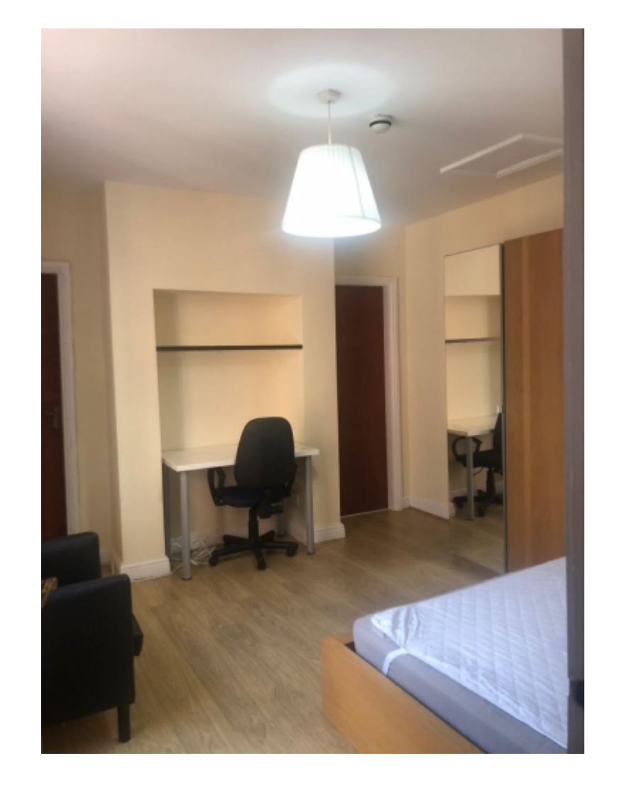
£144 Per Person Per Week