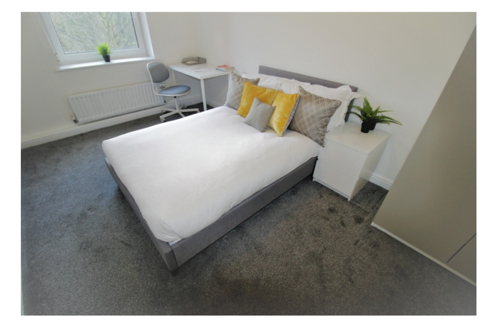
£159 Per Person Per Week