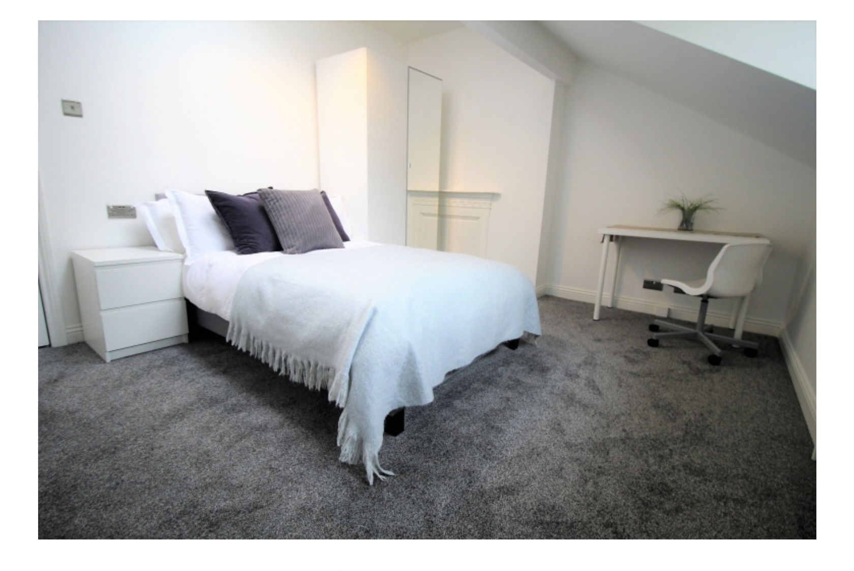
£159 Per Person Per Week