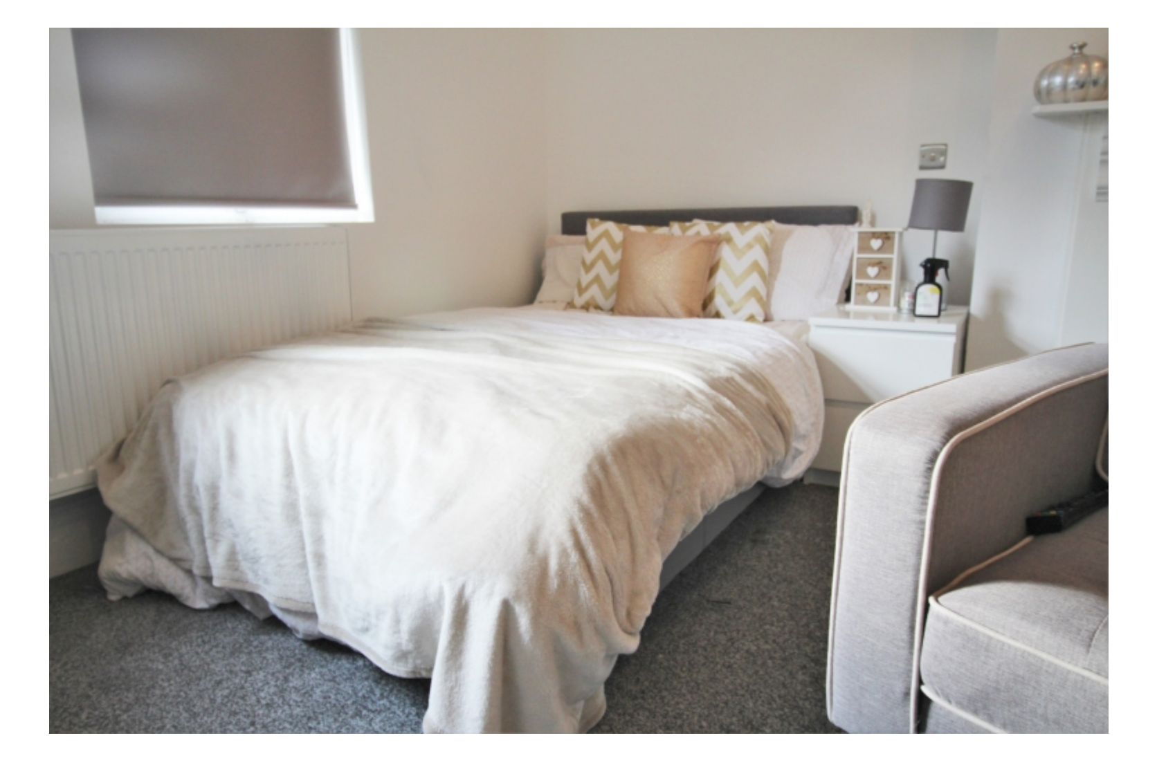
£189 Per Person Per Week